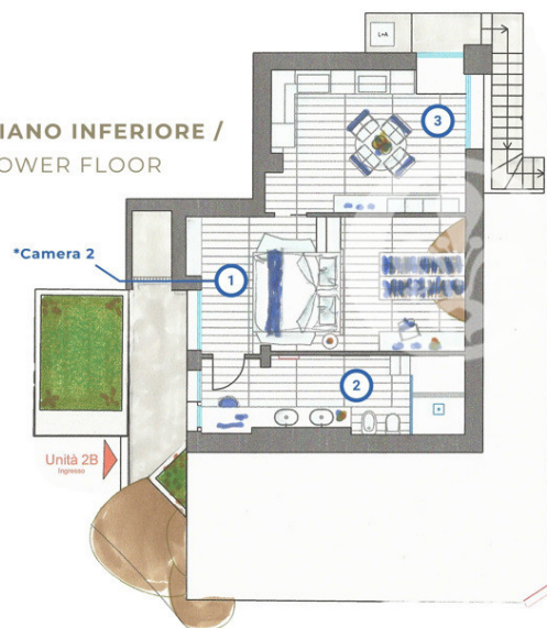
PIANO INFERIORE / LOWER FLOOR